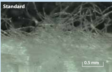
Belt edges after the impact of a defined force.

Frayfree belt types are particularly suitable for conveying packaged and unpackaged food, e.g. confectionery and baked goods.